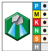
grade WU25PD TiAlN