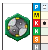
grade WK15PD AlCrN