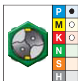
grade WP20PD TiAlN