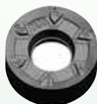
M200 iC 12 12mm iC insert 12 cutting edges