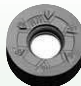
M200 iC 16 16mm iC insert 12 cutting edges