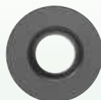
10mm iC RD Insert Type Ground and PSTS