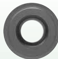
16mm iC RD Insert Type Anti-rotation Feature Ground and PSTS