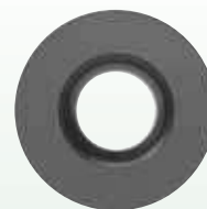
16mm iC RC Insert Type Anti-rotation Feature Ground and PSTS