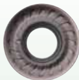
12mm iC RD Insert Type Anti-rotation Feature Ground and PSTS